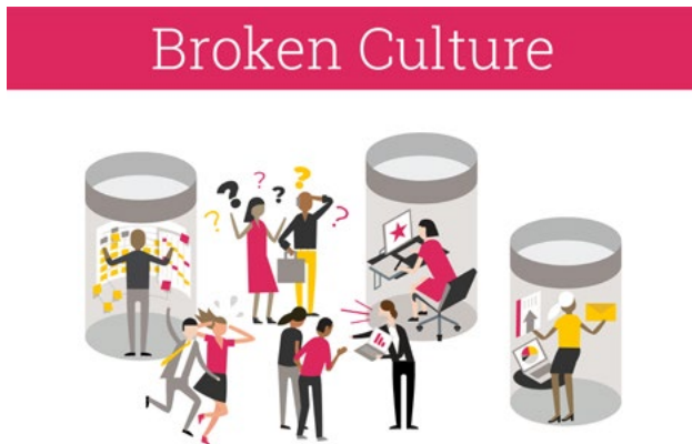
Figure 1 Broken Culture

Note. Broken Culture. Adapted from King, D. (2019). Why the most effective operations managers truly value great culture. Retrieved from: https://xblog.xplane.com/why-the-most-effective-operations-managers-truly-value-great-culture .