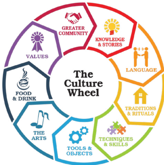
Figure 2 The Culture Wheel

Note. Adapted from Fonte Weaver, A. (2020). Celebrating our culture: The new how-to-guide. Retrieved from https://www.bridgestogether.org/celebrating-our-culture-a-new-how-to-guide/ .